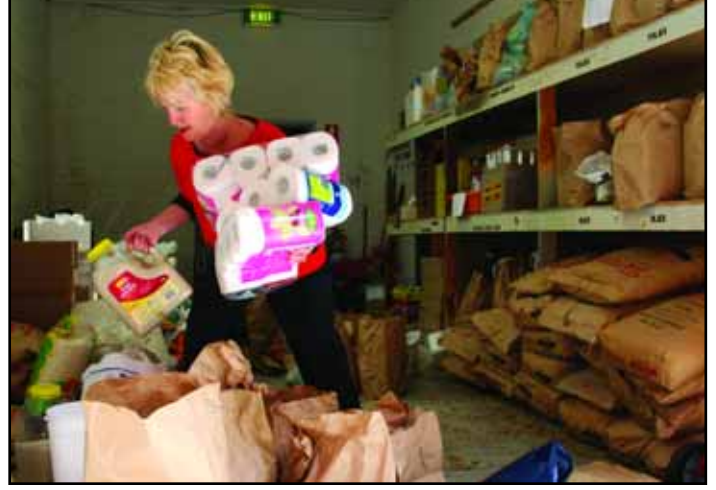
Foodbank at the Asylum Seeker Resource Centre receives an intake of donated food

However, I still remain angry as there has been no government culture change – the Howard government refuses to learn from its past failings. They continue with what appears to be a deliberate policy of destitution - forcing asylum seekers into lives of poverty and homelessness. We still have Mandatory Detention, Temporary Protection Visa's, offshore prisons such as Christmas Island being built and Bridging Visa E's that don't allow people to work, have an income or access to health care.